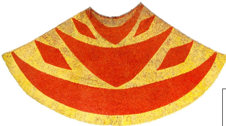
Chief's feather cloak, Hawaiian Islands, early 19 th century, National Museums Scotland (A.1948.274)

The use of featherwork in Hawaiian material culture is of particular note. Hawaiian cloaks of red and yellow feathers which came from honeycreepers unique to the islands are distinctive. Yellow indicated a person's political power and red, as in other areas of the Pacific, was a signifier of sacred power. Hundreds of feathers were attached to a base of knotted olona plant fibre to form bold geometric patterns.