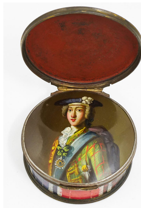
Jacobite snuff box

West Highland Museum acquired at auction a hidden portrait Jacobite snuff box dating from c1750. The museum holds extensive Jacobite collections including fine art, glass, weapons, medallions and memorabilia as well as a Jacobite archive. The snuff box is an example of the secrecy and symbolism employed by supporters of the Jacobite cause to express their allegiance to the Stuart dynasty. Appearing to be an ordinary snuff box with tartan decoration, its hidden double lid opens to reveal a finely enamelled portrait of Prince Charles Edward Stuart, based on the engraving by Sir Robert Strange (1721–1792).