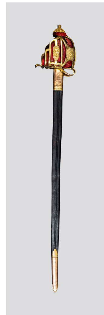
Basket-hilted backsword

The Museum of the Isles acquired a rare basket-hilted backsword presented by clansmen in 1802 to the 19th Chief of Keppoch, Alasdair na Ceapach. The collection represents the history of Clan Donald which has six main branches. The museum holds comparatively few objects from the Keppoch line which fell dormant in 1848, forty years after Keppoch's death. The basket-hilted sword was an essential part of the military culture of 18th-century clan society, a symbol of the martial prowess and traditional authority of the clan chief. Keppoch, who enlisted in the army at the age of 20 and had a distinguished military career, embodied these qualities. He was wounded at the siege of Toulon in 1793, served in the West Indies, and in 1797 was given a captaincy in the First Regiment of Foot, the Royal Scots. His regiment was with the Egyptian Campaign of 1801 and he was again wounded in the Battle of Aboukir. In 1805 he was promoted to Major. He retired soon afterwards and went to Jamaica where he died in 1808. Alasdair Keppoch never married and the representation of the family devolved to his only brother, Richard.