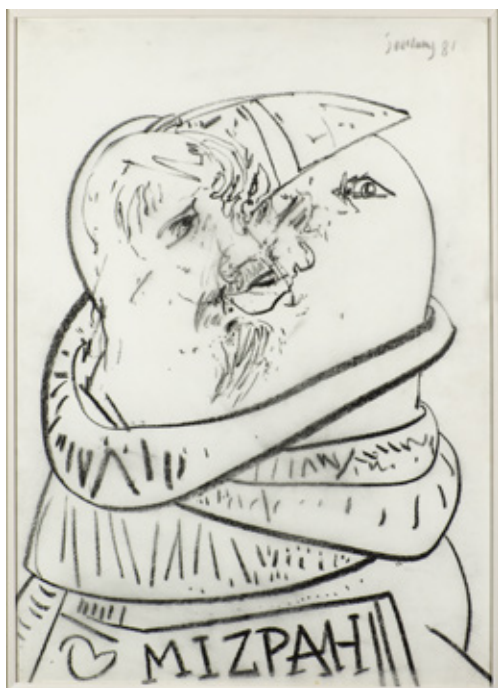
Charcoal on paper, Untitled [Mizpah], 1981, by John Bellany.