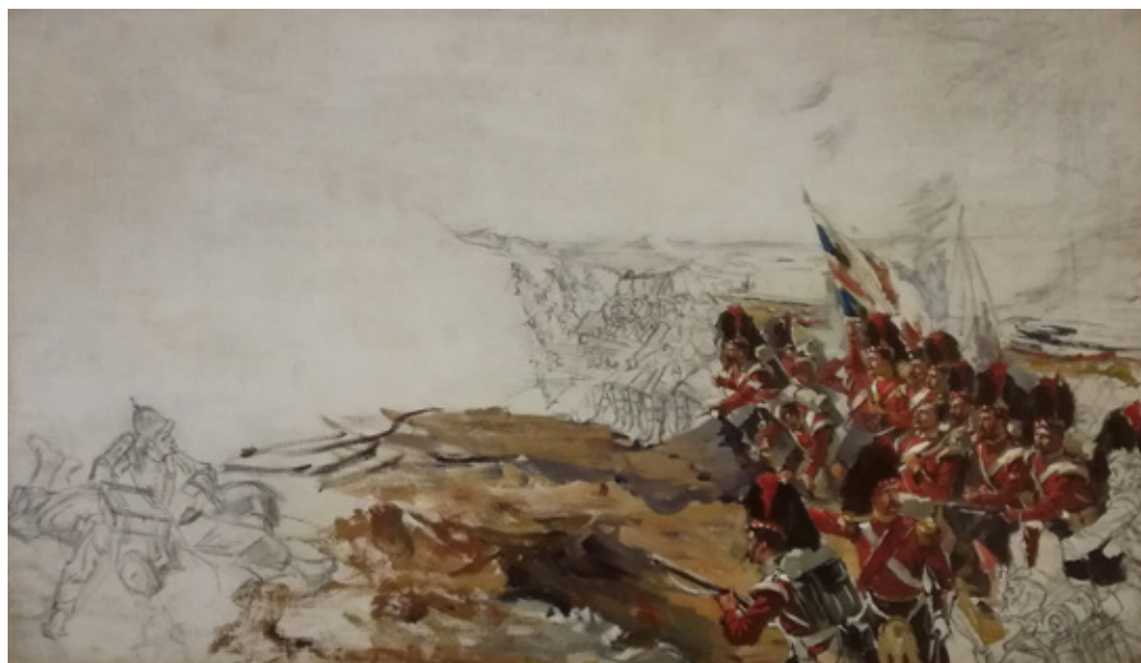
Oil sketch, Forward the 42nd , by Robert Gibb.

The Black Watch Castle and Museum acquired a preparatory oil sketch by Robert Gibb (1845–1932) for the finished composition Forward the 42nd which is now in the collection of Glasgow Museums. This famous painting, exhibited at the Royal Scottish Academy in 1899, depicts the Battle of the Alma on 20 September 1854, during the Crimean War. The oil sketch shows the 42nd Highlanders (the Black Watch) attacking on the right of the Allied positions towards the end of the battle during which Sir Colin Campbell, leading the Highland Brigade, gave the famous order ‘Forward the 42nd!’ The acquisition helps to tell the story of one of the most important events in the history of the regiment, marking their first action since the Battle of Waterloo in 1815.