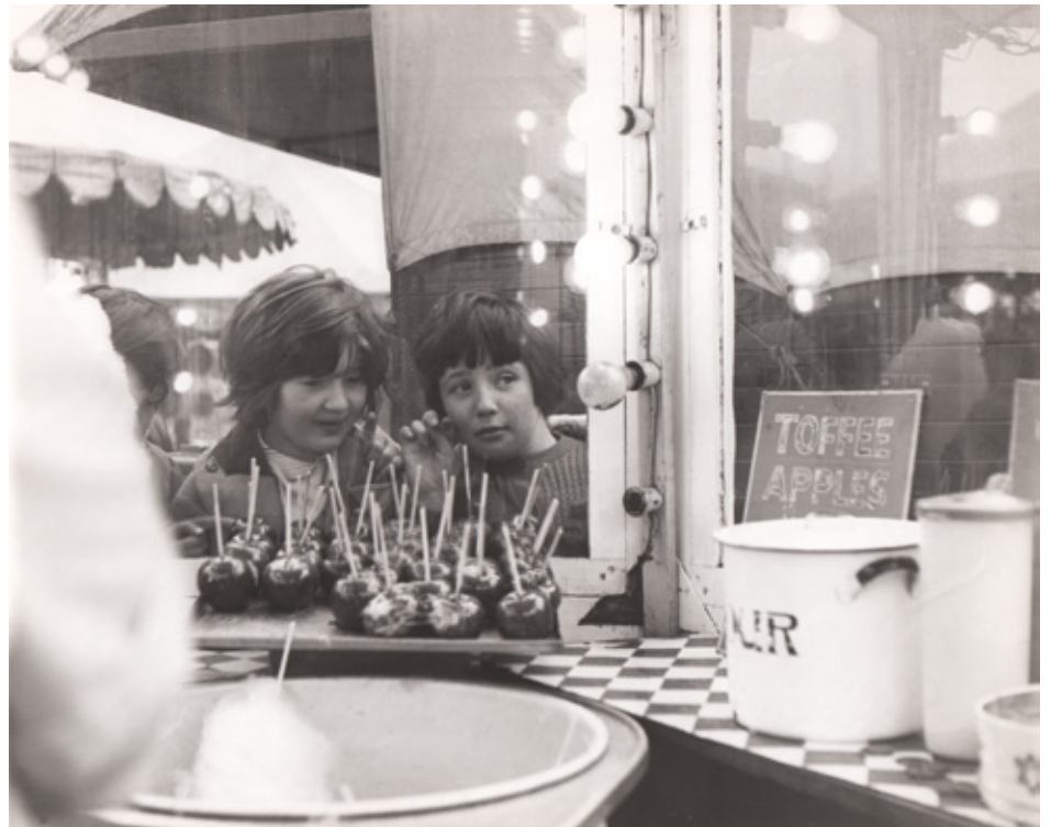
Photographic print, Toffee Apples, Carnival at Glasgow Green, 1963, by Oscar Marzaroli.