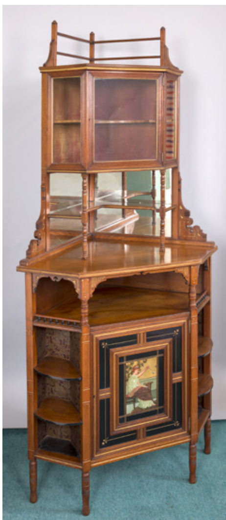
Walnut corner cabinet, c1880, designed by Daniel Cottier. Holmwood House.