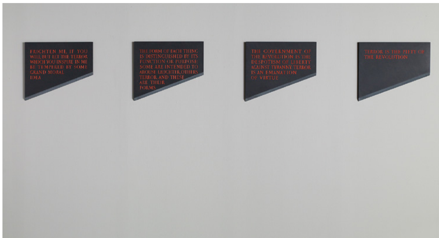
Slate, Four Blades , 1987, by Ian Hamilton Finlay with Nicholas Sloan. © Estate of Ian Hamilton Finlay.

The University of Edinburgh and the Scottish Maritime Museum each acquired sculptures by Ian Hamilton Finlay (1925–2006), a Scottish artist with an international reputation whose sculpture garden in the Lanarkshire hills, Little Sparta, is widely regarded as one of the most important in the world. Four Blades , acquired by the University of Edinburgh, a slate sculpture dating from 1987 created in collaboration with Nicholas Sloan (b1951), embodies the history, politics and imagery of the French Revolution, a central theme in Finlay's art. The blades refer to the guillotine; engraved on each one are quotations from Diderot, Poussin, Robespierre and Finlay himself which explore the complex interplay between rational enlightenment and the terror which the instrument evokes. This is one of the most significant works to be acquired for the University's Modern and Contemporary Art Collection and relates well to the teaching at the University where Finlay's work features in undergraduate and postgraduate courses across several disciplines.