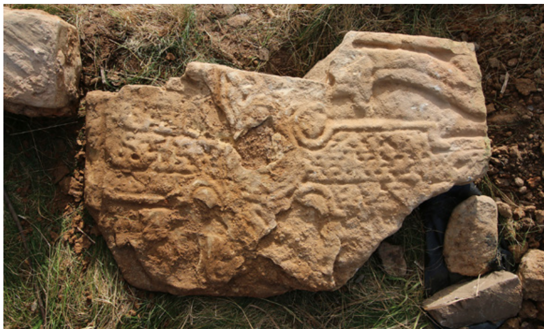
Fragment of Early Historic Pictish cross slab found at Deerness.

The Orkney Museum acquired a fragment of a Pictish cross slab which was spotted eroding from a cliff face at Deerness. One face bears interlace design and an S-dragon while the other has depictions of two Pictish beasts. This is one of only three Pictish cross slabs known from Orkney.